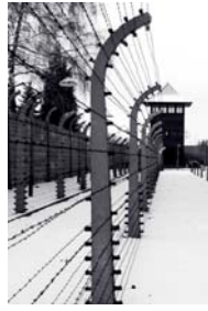
Survivors of the Holocaust.

Stay tuned for news of the Grand Opening and House Blessing. There are still a few boxes to unpack and pictures to hang before the big event.