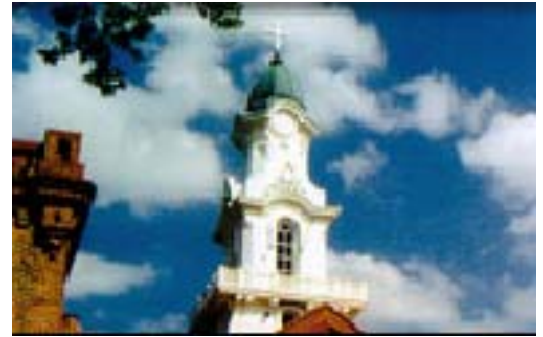
The Tower at Aspinwall Hall, VTS

I have just returned from several days of retreat and reflection at Virginia Theological Seminary, where I received my theological education. Along with about sixty other graduates of VTS – from the classes of 2002 through 2005 – I’ve been part of a ‘pilot program’ funded by the Lilly Endowment. Seeking to understand how the transition from seminary to ministry might be enhanced, Lilly funded yearly retreats back to VTS, as well as substantial Continuing Education funds. The entire cohort of ‘lab rats’ were called back to VTS at the end of May for a final de-briefing with Lilly and to help dream about how the program might continue. It was a wonderful time to reconnect with many friends from Seminary. And – we found out that Lilly has funded the Continuing Education grants for 2009 and 2010!