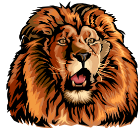
The Chronicles of Narnia.

This year's conference will be exploring